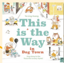
This is the Way in Dog Town by Ya-Ling Huang